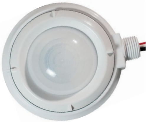
End Mount WASP2 Sensor with lens option

The WASP2 Indoor/Outdoor Occupancy Sensor is specifically designed for ON/OFF control of high bay fixtures in warehouse, distribution centers and similar facilities. The WASP2 sensor is also available for low mount applications when using the appropriate lens. The sensor is available in end mount and surface mount versions with either single or dual outputs.