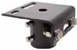
Optional slip fitter adaptor Part #: Slipfit-UV